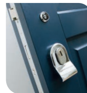
Colonial Lock with thumb turn mechanism