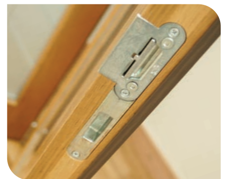
PAS 24:2012 Secured By Design multi-point locking