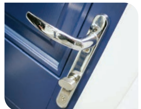
A wide range of Handle finish options are available

Single and double doorsets, bi-fold, sliding patio doors and stable doors all available