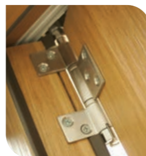
Secured By Design doors available including Bi-Fold