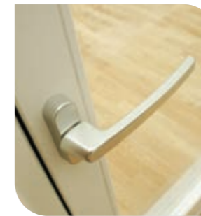
Sliding Patio Doors available