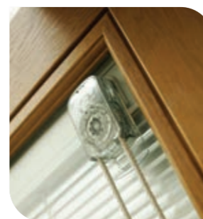
Integral Blinds available