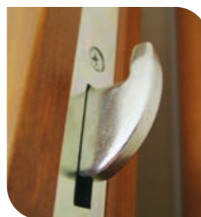
Pas 24:2012 Secured By Design multi-point locking system

Laminated timber is carefully selected and engineered to meet the BS EN942 standard ensuring knots and other defects are minimised. Espagnolette hinges come with enhanced corrosion resistance and door hinges have built in anti-wear bearings for long service life.