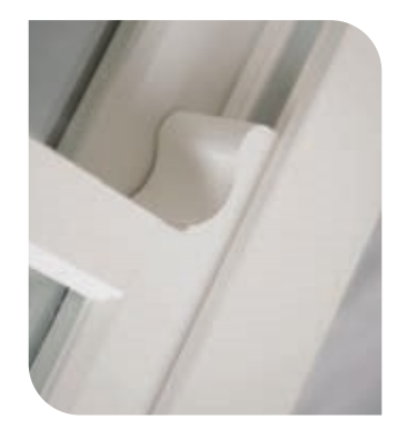
Sash horns to bottom sash available upon request (not available with tilt option)