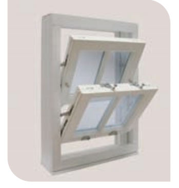
Double tilt facility as standard for cleaning