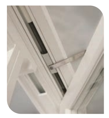
10 year guarantee on spiral balance and weights and pulley running gear